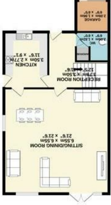
GROUND FLOOR (753 sq ft / 69sqm)