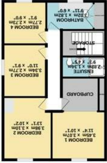
1ST FLOOR (620 sq ft / 57sqm)